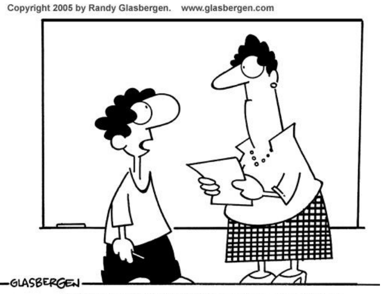
"I TURNED IN MY HOMEWORK TWO DAYS LATE, BUT NORMALLY IT'S FOUR DAYS LATE, SO TECHNICALLY IT'S EARLY!"

UW-Stevens Point values a safe, honest, respectful, and inviting learning environment. In order to ensure that each student has the opportunity to succeed, we have developed a set of expectations for all students and instructors. This set of expectations is known as the Rights and Responsibilities document, and is intended to help establish a positive living and learning environment at UWSP. Click here for more information: <u>http://www.uwsp.edu/stuaffairs/Pages/rightsandresponsibilities.aspx</u>